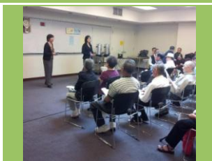
Audience listening to the presentation

Videos by Family Bridges, Inc., a health partner of the Hotel Oakland Village .