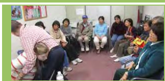
Family Caregivers learning from PTs

populations. Another Culturocity Training will be held in November for all Family Bridges staff. Family Bridges makes sure to remain culturally aware and sensitive as our community's demographics change.