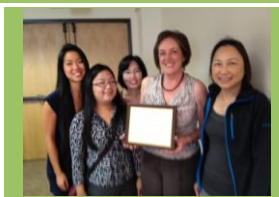
Hong Fook SCAN Home Health Project Team

Family Bridges is positively impacted by CCI, as nearly all of our clients who participate with our Hong Fook Community-Based Adult Services (CBAS) are dual eligible beneficiaries. Come April 2014, the Hong Fook Center along with other LTSS providers will be part of a large coordinated effort by the health plans to deliver the most seamless and highest quality of care!