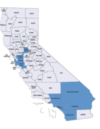
California's 8 Participating Counties

CCI marked an important step toward transforming California's Medicaid care delivery system to better serve low-income seniors and persons with disabilities.